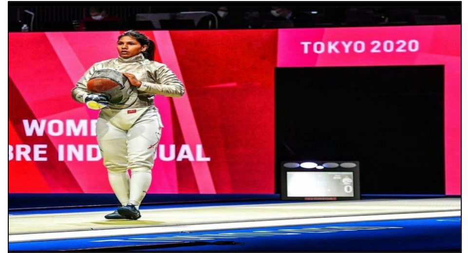
Bhavani Devi has become the first ever Indian Fencer to qualify and win a match in the Olympics (Tokyo 2021)